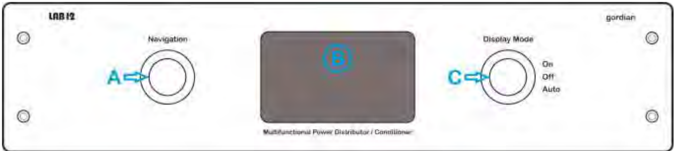
Gordian front panel

On the front panel you will see the OLED display, the navigation rotary knob and the display mode rotary knob.